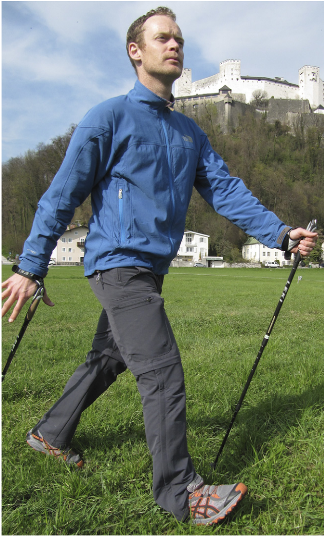
Figure 1. Nordic walking, an outdoor sport

and “exerstriders.” In a second step, all items were amended by each of the cited diseases. If an article included more than one search item, it was counted only once during further analysis. The search was limited to articles written in English and German and a time range of 1950 to the present. Data collection took place between November 2010 and May 2012, and data analysis was performed between April 2011 and May 2012. References of all included articles were checked for further relevant publications.